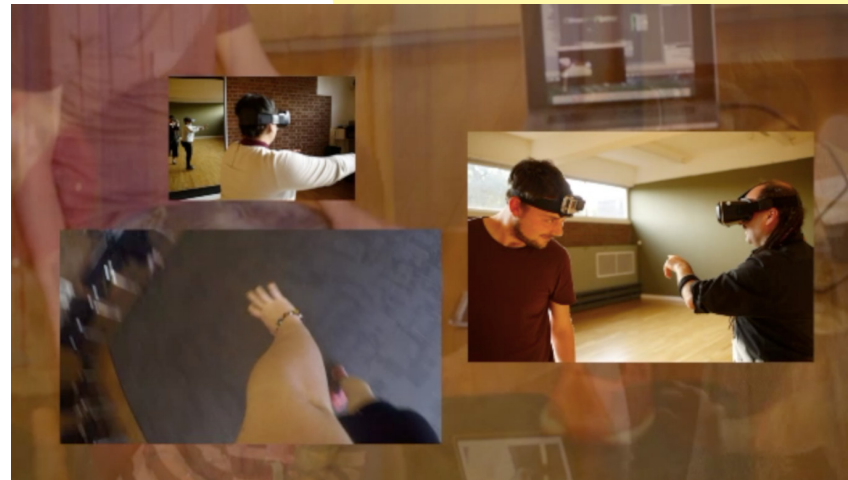
Image credit: SOMA rehearsal, photograph Sonya Russell-Saunders, 2016.