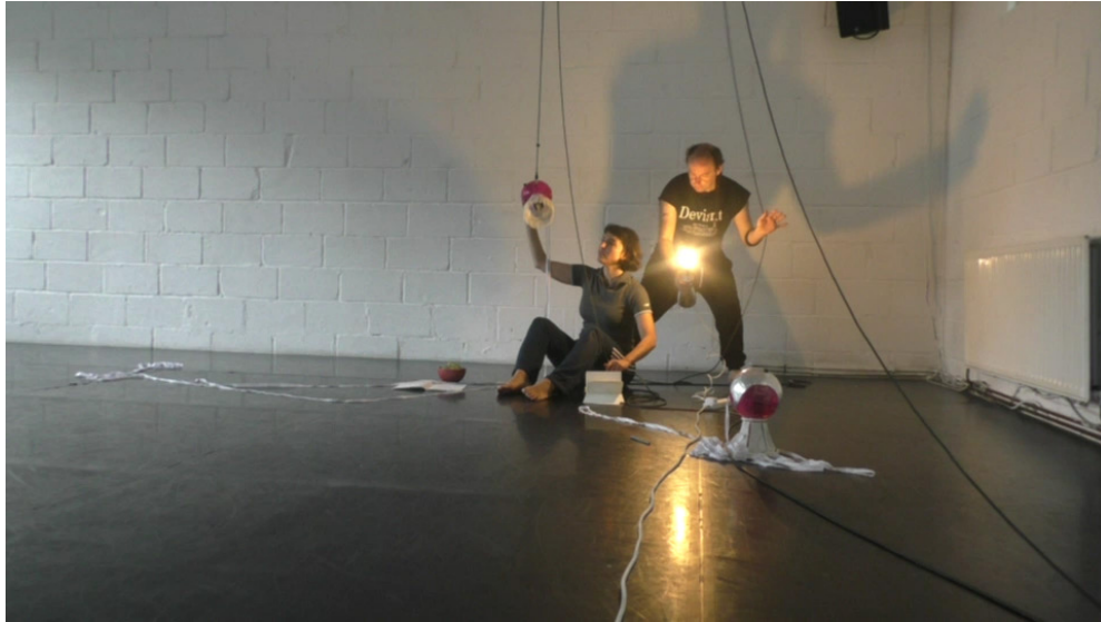
Image credit: Neal Spowage & Danai Pappa, 2016, credit Neal Spowage.