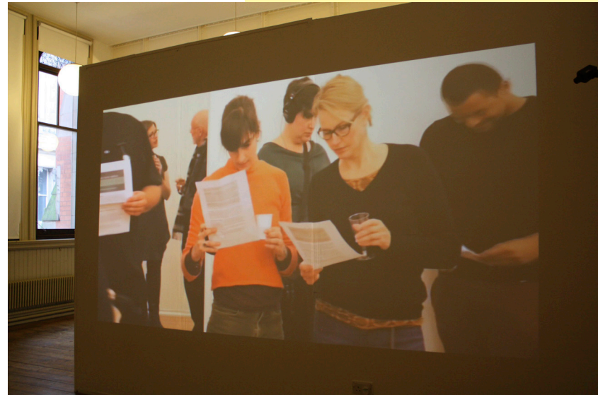
Image credit: Interaction Order, 2013, film Tim J Pratt, performer Anais Lalange, photograph by Sonya Russell-Saunders.