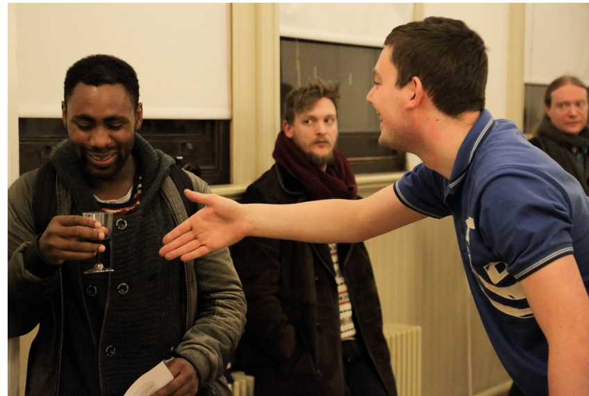
Image credit: Interaction Order , 2014, photograph by Tim J Pratt.